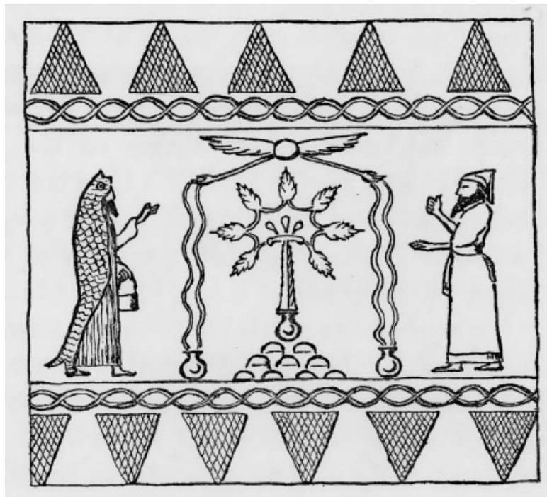
4. (Ataç, 2018:97)