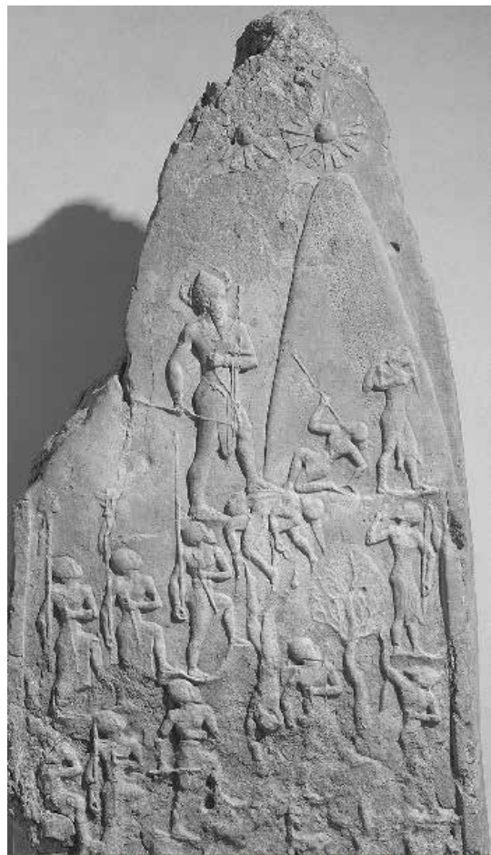
)Feldman, 2005: 293: ( .1